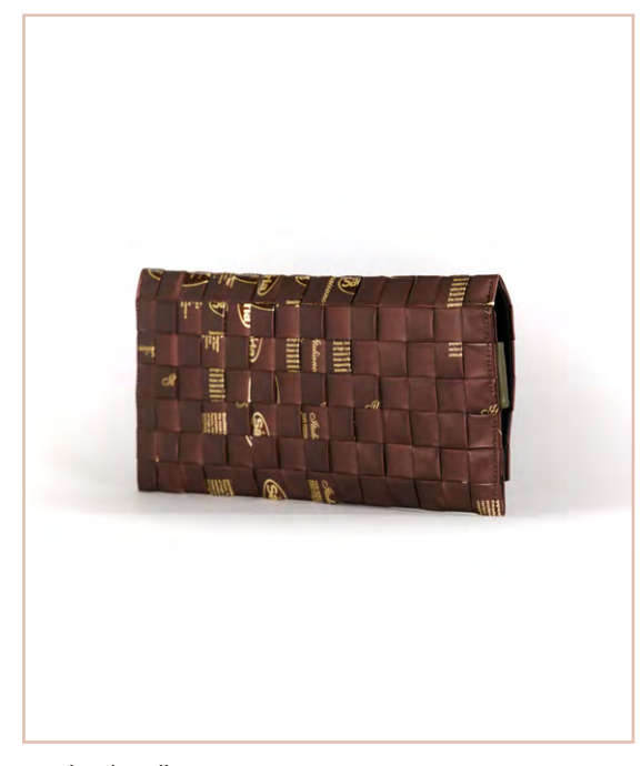
Leather handle moss green