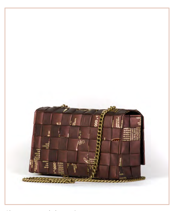
Chain strap and closure brass