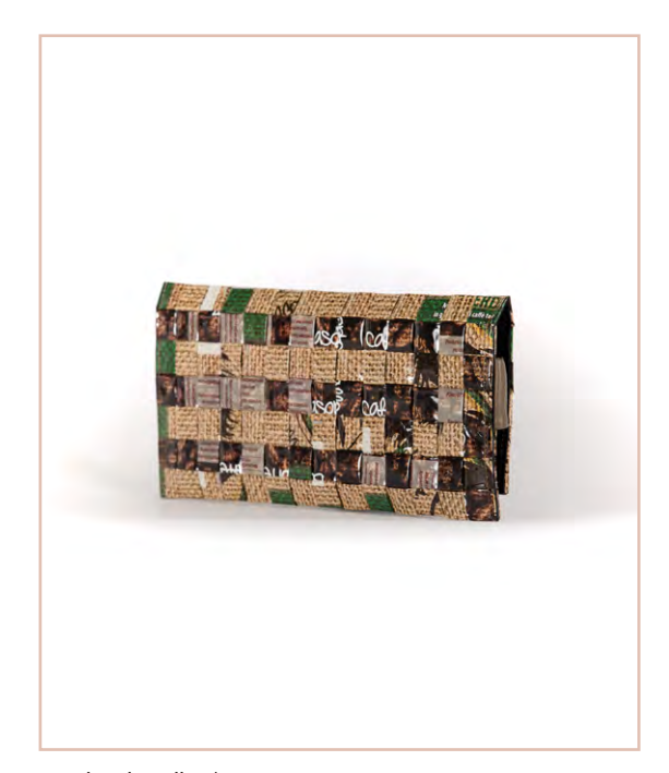
Leather handle dove grey