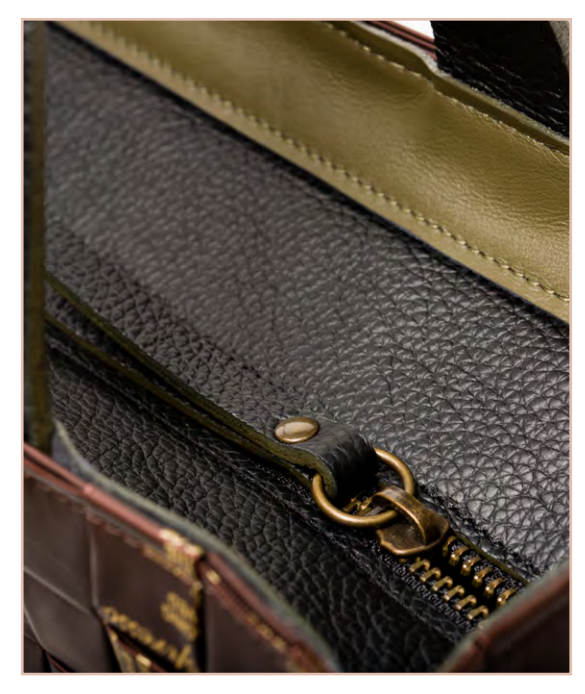
Handle black - Upper part black