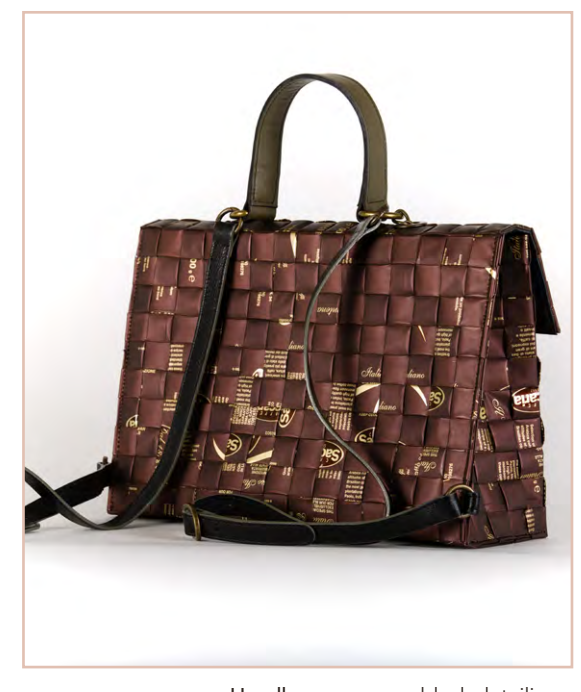
Handle moss green black detailing - Shoulder straps black, moss green detailing

Material Exterior coffee bags Details cowhide leather Lining 100% cotton