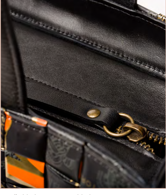
Handle black - Upper part black