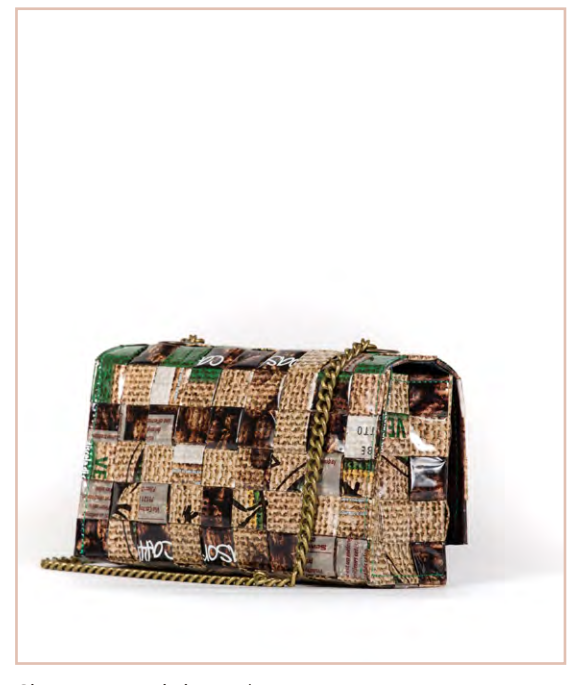
Chain strap and closure brass