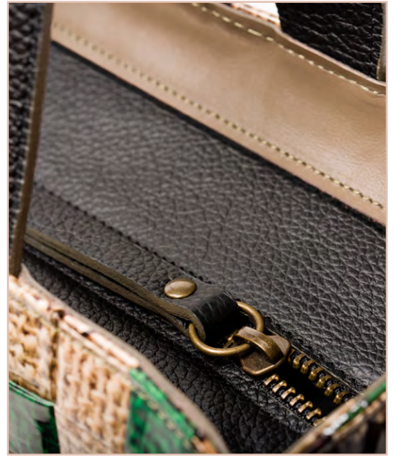
Handle black, dove grey detailing -Upper part black, dove grey