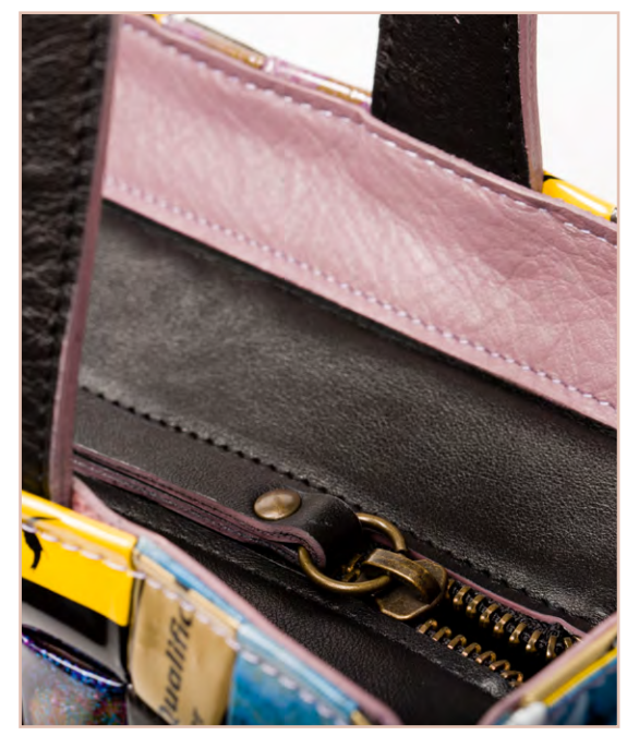
Handle black, lilac detailing - Upper part black, lilac