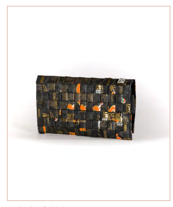
Leather handle black