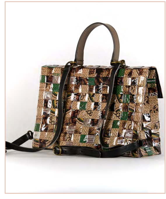
Handle dove grey, black detailing - Shoulder straps black, moss green detailing

Material Exterior coffee bags Details cowhide leather Lining 100% cotton