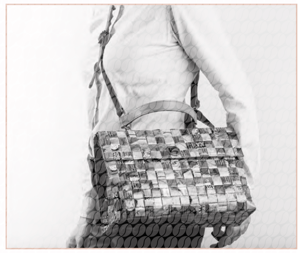
Customizable style Two handles for four models