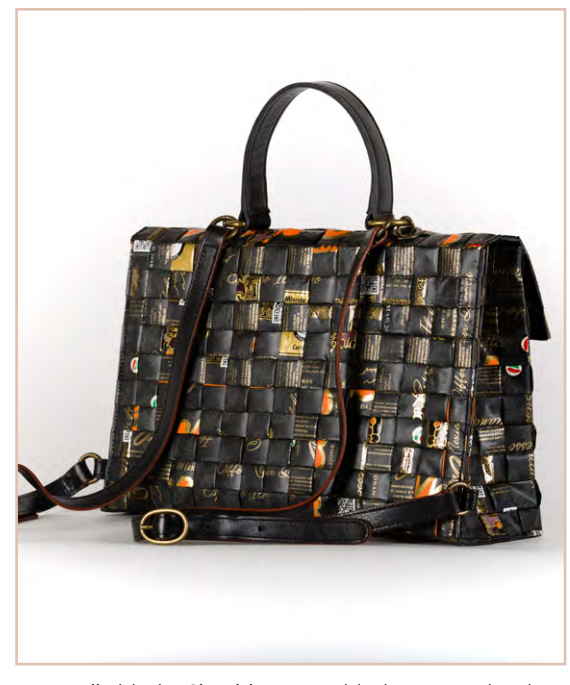
Handle black - Shoulder straps black, orange detailing