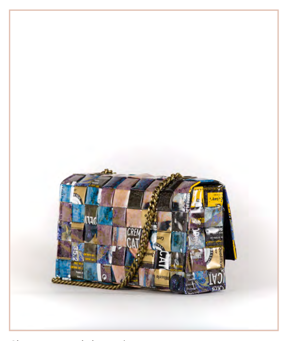
Chain strap and closure brass