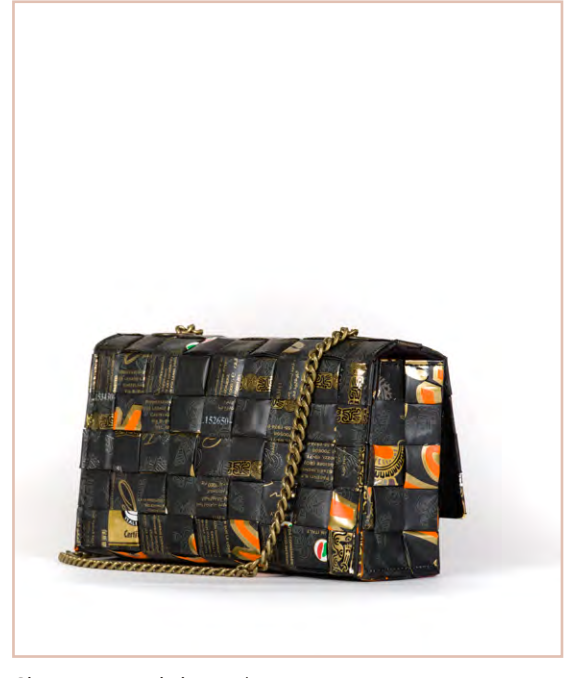
Chain strap and closure brass

Materials Exterior coffee bags Chain strap zamak Lining 100% cotton