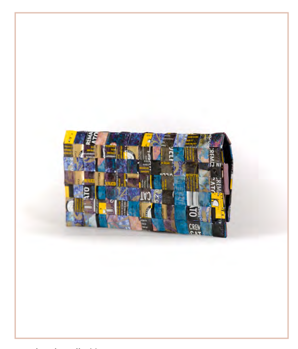
Leather handle lilac